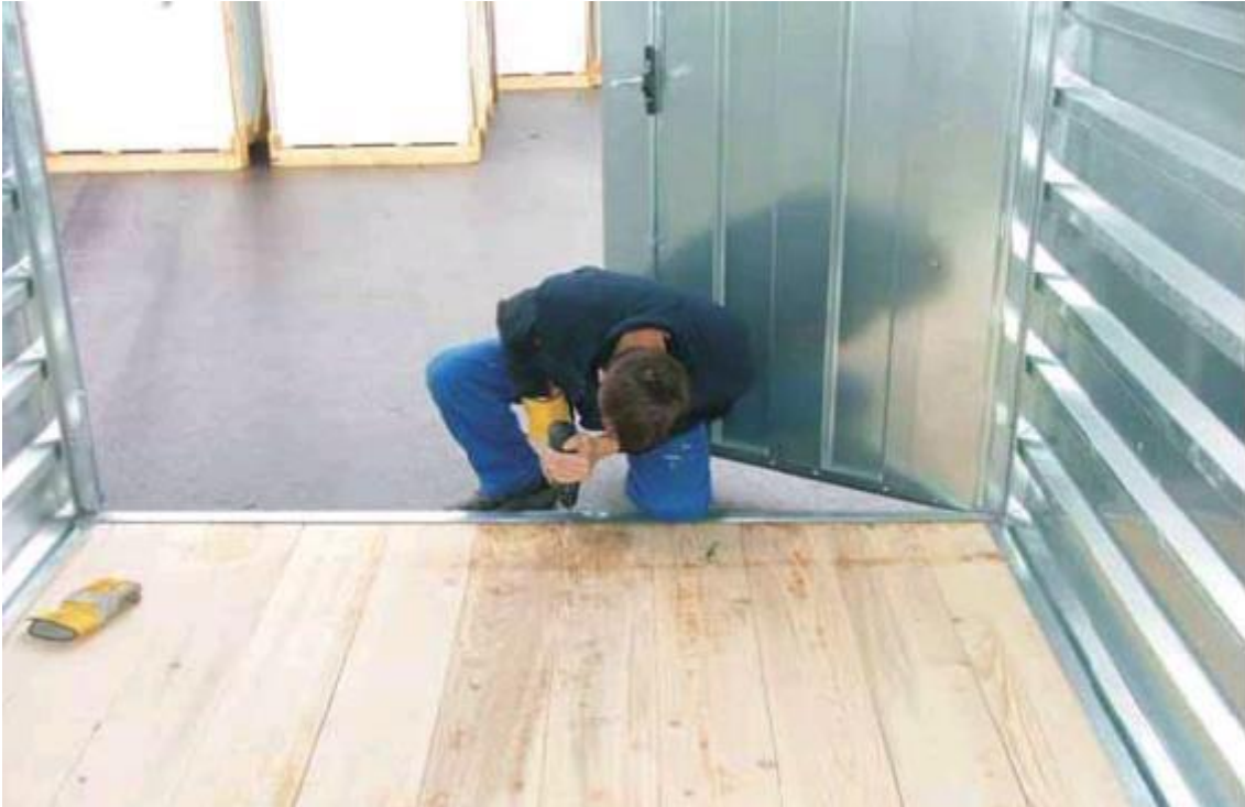
Drilling is only necessary in the type with hook and lock