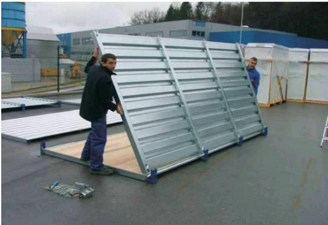
Putting the panels on the base