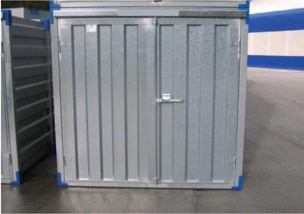
Container with bolt