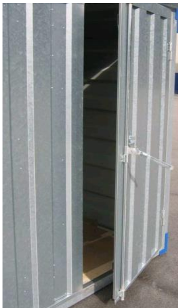
Type with bolt