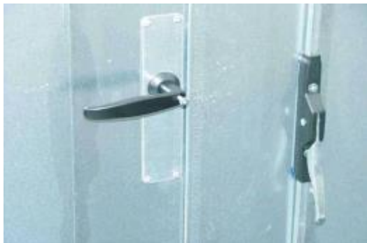
Type with hook and lock