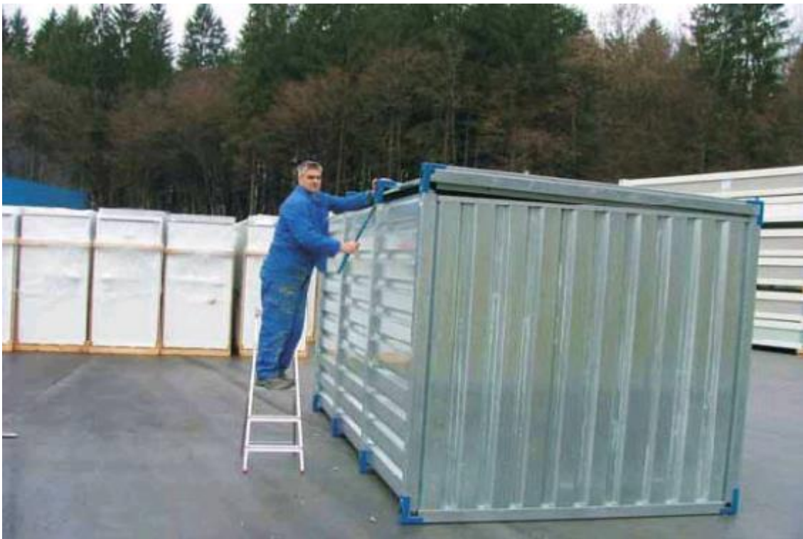
Fixation of the roof