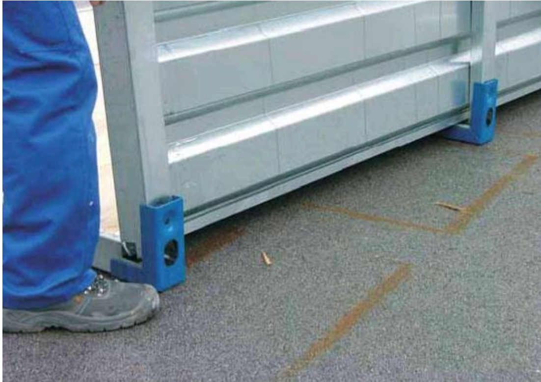
Screwing the panels when they are on the base